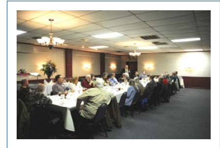
Next ACBA meeting on January 17, 2011